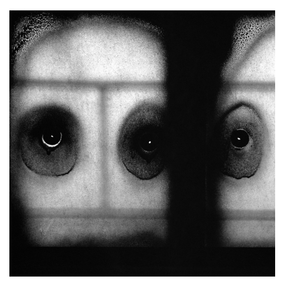
Stare 5040, 2008 © Roger Ballen