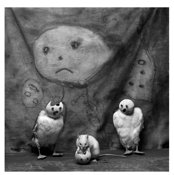
Devour, 2013 © Roger Ballen